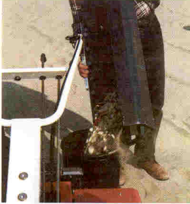
The 5.3 gallon (20 liter) collector can be emptied easily into either of the onboard storage hoppers.

H. Barber & Sons, Inc., the premier US manufacturer of beach cleaning machines, introduces the newest addition to our line of sand cleaners; the SAND MAN walk-behind cleaner.