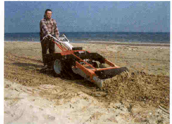
The optional front scraper can be used for moving and contouring sand.

The SAND MAN elevates the sand and utilizes a vibrating screen to separate the debris. The debris is then deposited into the collector. There are three interchangeable screens with mesh sizes of 3/16", 3/8" & 9/16". The smaller mesh is used for ultra fine cleaning and the larger mesh allows for deeper cleaning and rapid speed in wet sand. Cleaning depth can be easily adjusted, from 0-4", by the operator while the machine is in use.