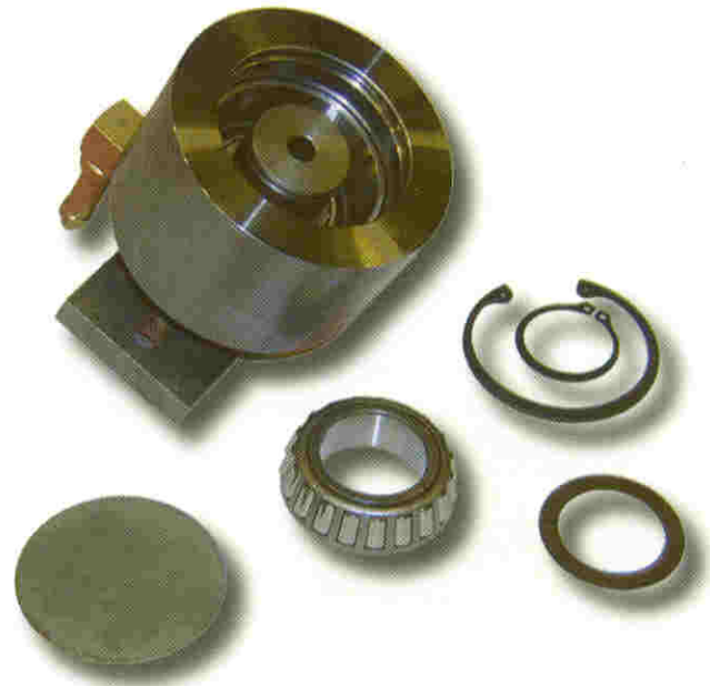
549AS10 Roller Assembly

At BARBER, we are continually improving our equipment by adding new technology and higher quality components. The 549AS10 Roller Assembly is only one of the many new improvements that will be seen on all of our products in the new millennium.